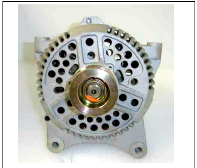
2009 Ford 5.4/6.8L OEM tie-in with special control for E/F series chassis.