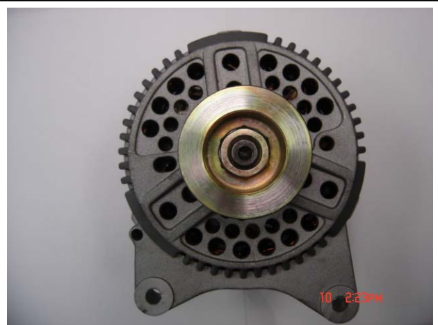
Typical Application-Ford F-series 5.4/6.8L 1997 - 2006 model year See Application Guide for Specific Models