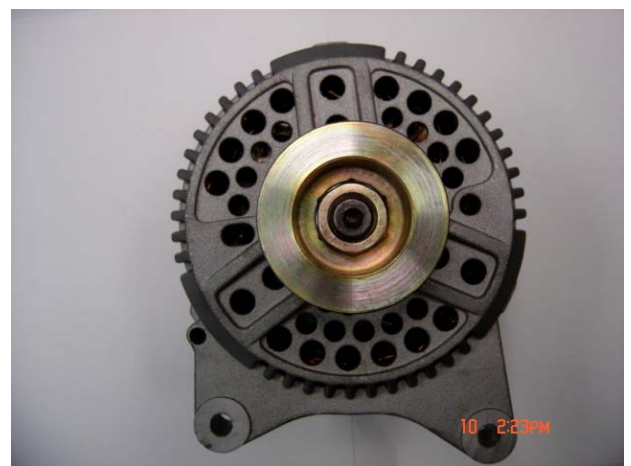
Typical Application-Ford F-series 5.4/6.8L 1997 - 2006 model year See Application Guide for Specific Models