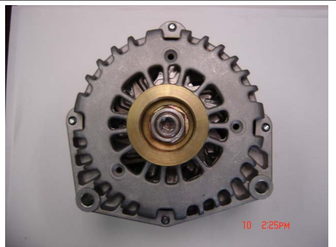
Typical Application-Suburban Police/Emergency See Application Guide for Specific Models