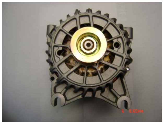
Typical Application: E Series 07-08 5.4L/6.8L Direct OEM Retrofit/Tie in Systems