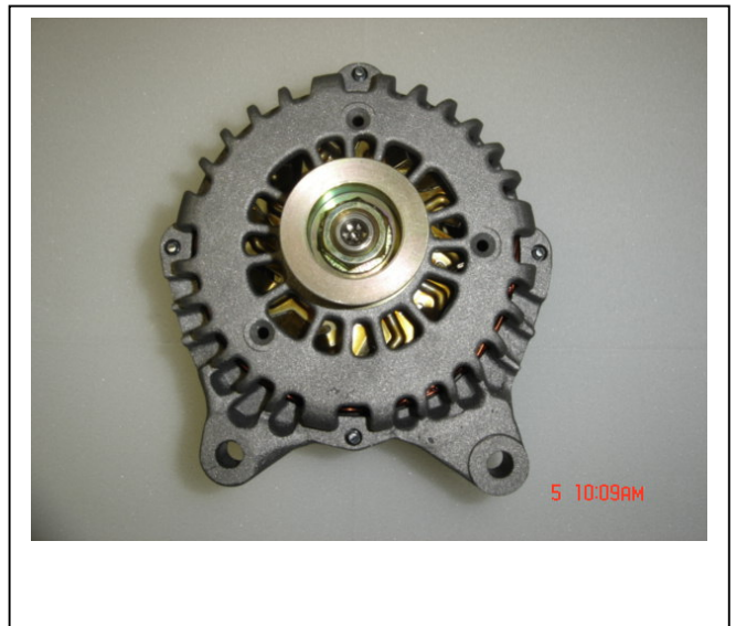
2008 and down Ford 5.4/6.8L engine without PCM for E/F series chassis.