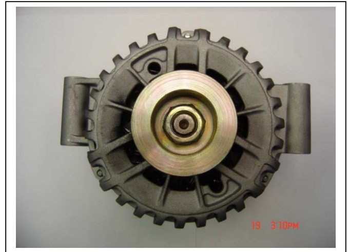
Typical Application-Ford 2011 F-Series/6.2L See Application Guide for Specific Models