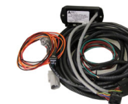
HIGH IDLE CONTROL

Direct OEM replacement alternator delivering up to 360 amps + High Idle Control