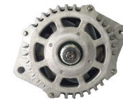
ALTERNATOR 255HPI-17220-12 255 Amps | 12 Volts