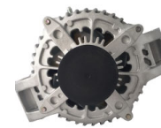
ALTERNATOR 185HPI-FTAN-28 185 Amps | 28 Volts