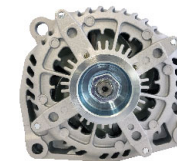
ALTERNATOR 160HPI-PM3.6-58 160 Amps | 58 Volts