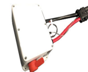
LI-ION STORAGE SYSTEM 28 Volts