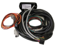
HIGH IDLE CONTROLS

APS dual alternator kit on a Toyota Land Cruiser 200 Series (petrol) in the field: Secondary, 360-amp, 12-volt alternator is visible here.