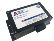
SMART REGULATOR APS-500