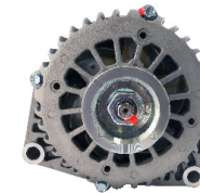
ALTERNATOR 185HPI-GMEXT-28 185 Amps | 28 Volts

Ford F-250 6.2L Gas Other Ford F-Series vehicles Many more vocational truck platforms