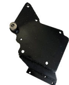
ALTERNATOR BRACKET KDV-6V903