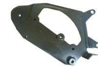
ALTERNATOR BRACKET KMF-8WP-92V49