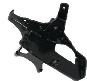
ALTERNATOR BRACKET T70MK4.2-17220-80E