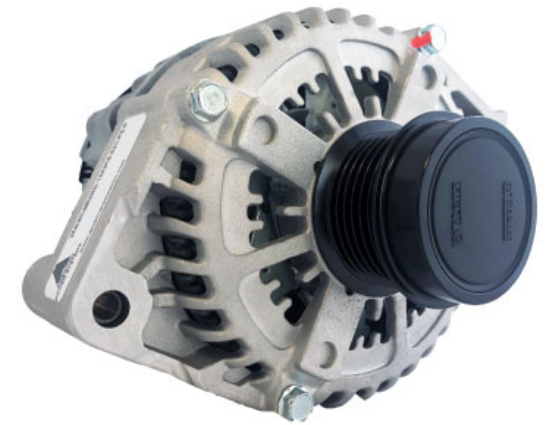
PRIMARY ALTERNATOR REPLACEMENT 255HPI-MRZRD-12/HPI6-52C-P-S-0 255 Amps | 12 Volts

Other light utility vehicle applications