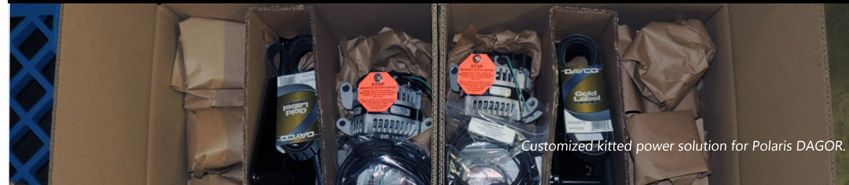
Customized kitted power solution for Polaris DAGOR.