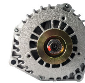
ALTERNATOR 360HPI-GMRVC-12 185HPI-GMEXT-28 360 Amps | 12 Volts 360 Amps | 28 Volts

Chevrolet Sierra Chevrolet Suburban Chevrolet Tahoe